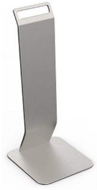
MPH28981 Metal Table Stand 180mm (W) x 160mm (D) x 500mm (H)